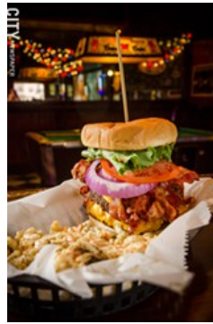
The Double Bacon Chicken Cheeseburger (a cheeseburger, bacon, and chicken fingers on a roll) with mac salad, from Marshall Street.