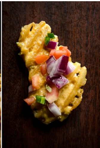
Marshall Street's Irish Nachos made with waffle fries and topped with jalapeño-queso, onions, tomatoes and jalapeños